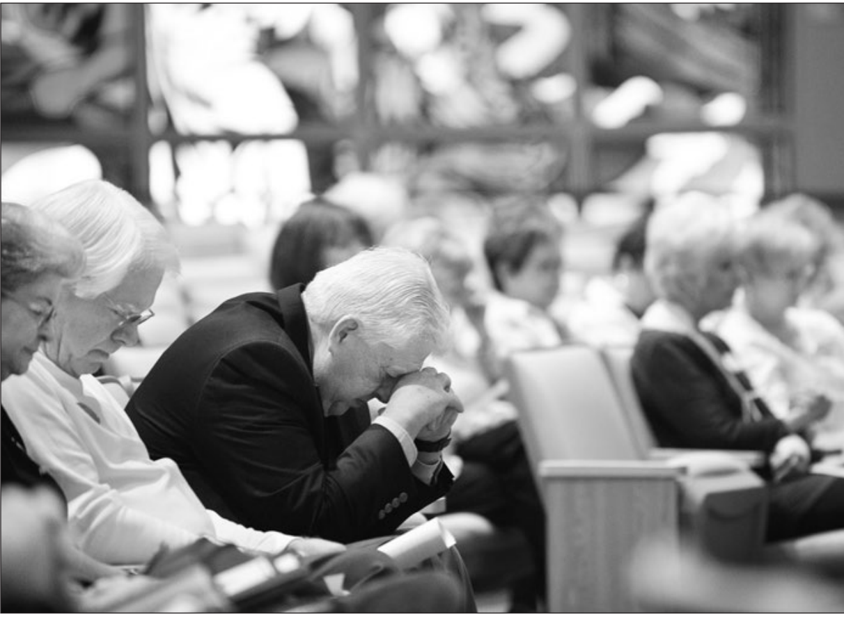
Attendees bow their heads during Thursday's National Day of Prayer service held at The Worship Place in Sun City. This is the sixth year The Worship Place has conducted a service to mark the day. The National Day of Prayer began in 1952 and now the occasion is observed at about 47,000 sites around the United States. Right , members of The Worship Place choir singing the hymn "Down To The River To Pray."